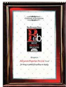
"THE BEST REALTY BRAND" BY THE ECONOMIC TIMES 2015